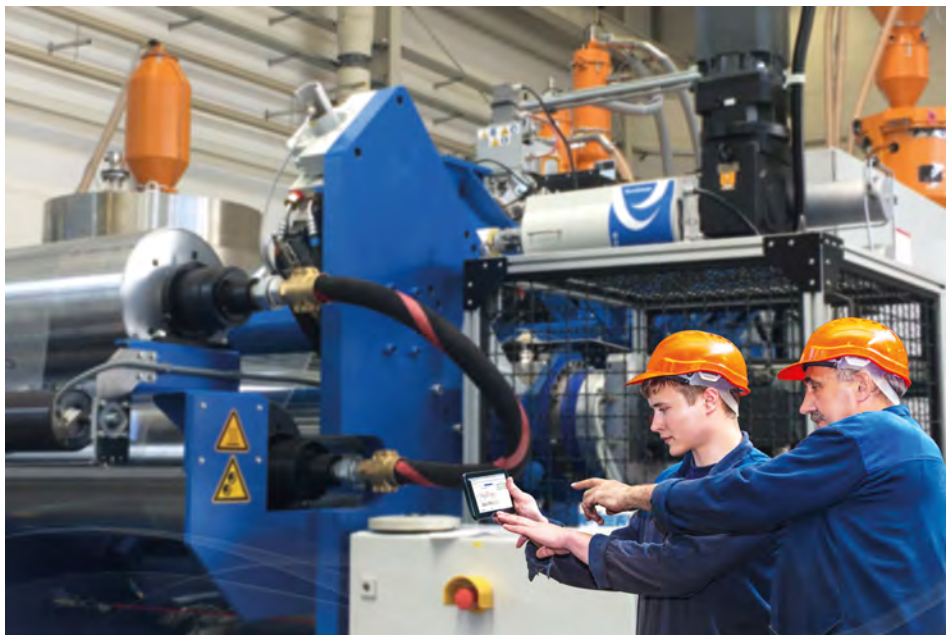
Correlate your rheological data from the lab to the production floor.