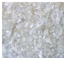
PET bottle flake