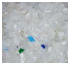
HDPE milk jugs