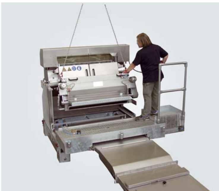
Cutting head quick-change