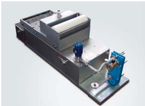
Process water treatment system PWS-BF