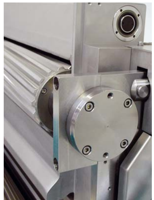
Roller bearing support outside of cutting chamber