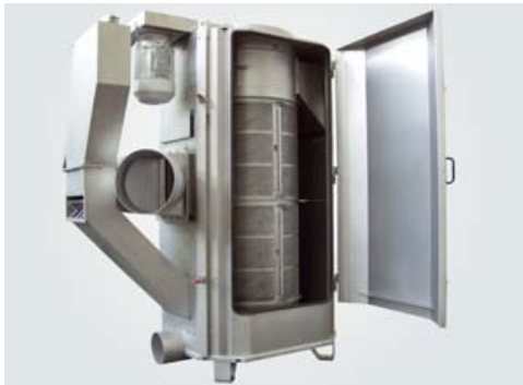
CENTRO centrifugal dryer