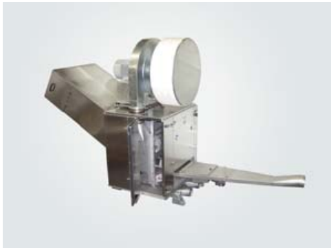
AERO impact dryer