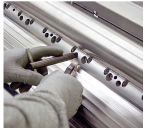
Cutting gap setting