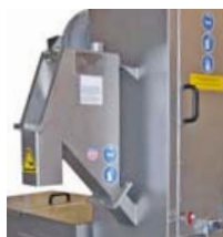
Model 4 Manually Operated Agglomerate Catcher