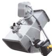
Pneumatically Actuated Pellet Diverter Valve