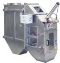
Model 12 Pneumatically Actuated Face Seal Agglomerate Catcher