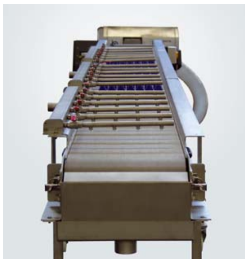
View of the conveyor belt section