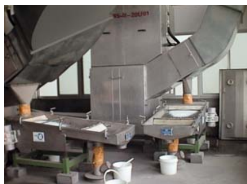
AERO dryers in a production facility