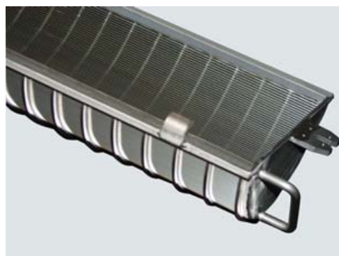
Slotted screen for AERO 800