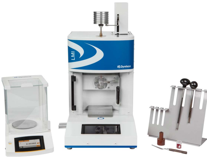
SHOWN WITH ALL AVAILABLE OPTIONS

THE MOST ACCURATE MELT FLOW INDEXER WORLDWIDE