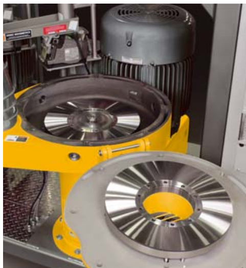
Mill Chamber with Disposable Discs